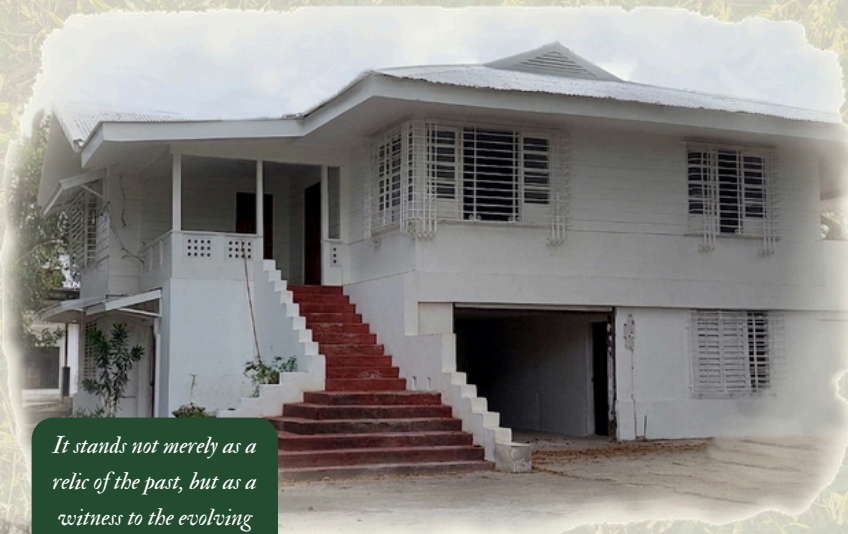
It stands not merely as a relic of the past, but as a witness to the evolving story of the institution and the community it serves.