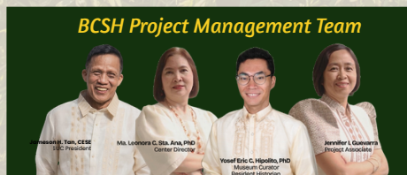
BCSH Project Management Team