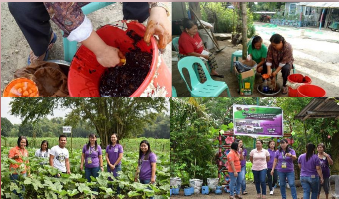
The project members in action as they monitored the project location in Sumandig, San Ildefonso Bulacan.