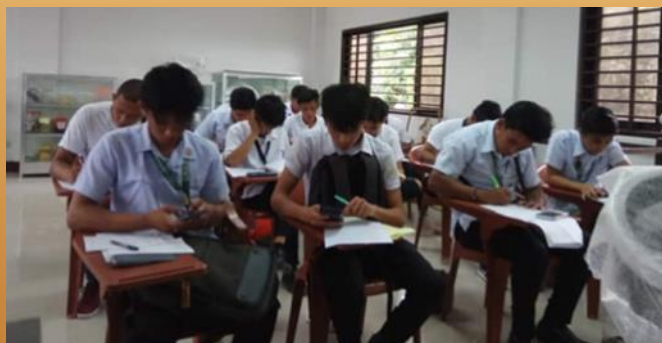
Fourth year Bachelor of Animal Science students answering the questionnaire on the evaluation of the OJT