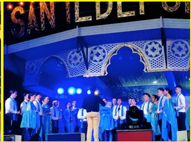
BASC SoundSchool Band (LEFT) Con Amore Choir (RIGHT) Participated in the "Gabi ng BASC" a mini-concert sponsored by the BASC Cultural Affairs during San Ildefonso Town Fiesta celebration (January 15, 2020)