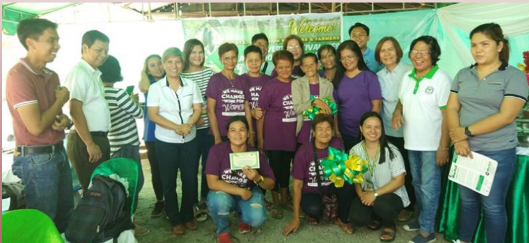
Participants to the FFS on Mechanized Rice Cultivation on April 26, 2019 from San Ildefonso, Bulacan were mostly composed of women (center, wearing purple shirts). They posed here along with officials from BASC and its partner agencies in the implementation of Palayamanan-related projects.