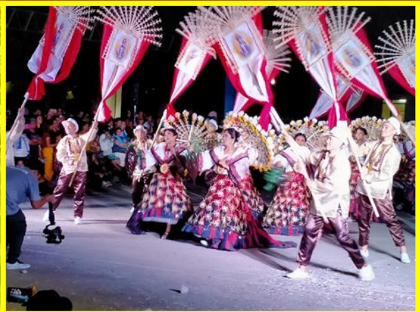
BASC Laboratory High School participated in the Street Dance contest during Bulak Festival 2020 where they won 2 nd place (January 22, 2020)