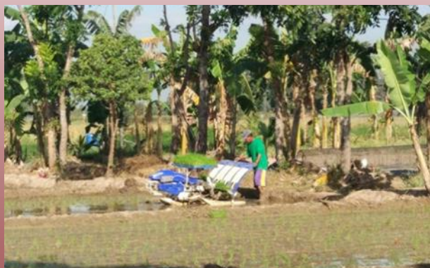
Demonstration on the use of mechanical transplanter during the project launching on Feb. 12, 2019.