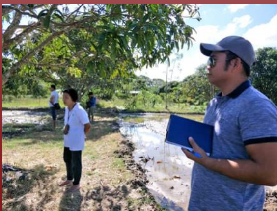
Monitoring by PhilRice personnel on Feb. 1, 2019 at NCT-HR project site.