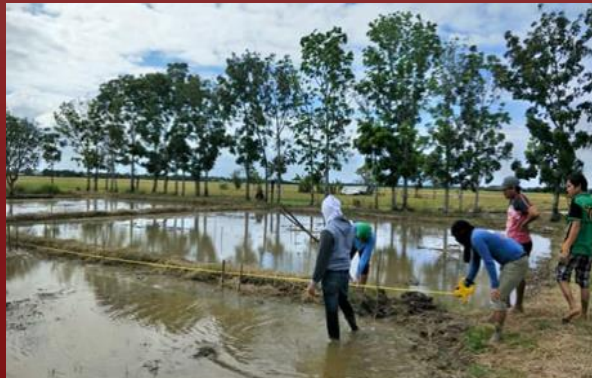
Lay-outing of the project area for NCT-MAT last January 25, 2019.