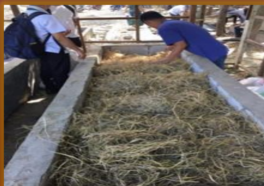
Rice straws are being laid out on one of the vermibeds