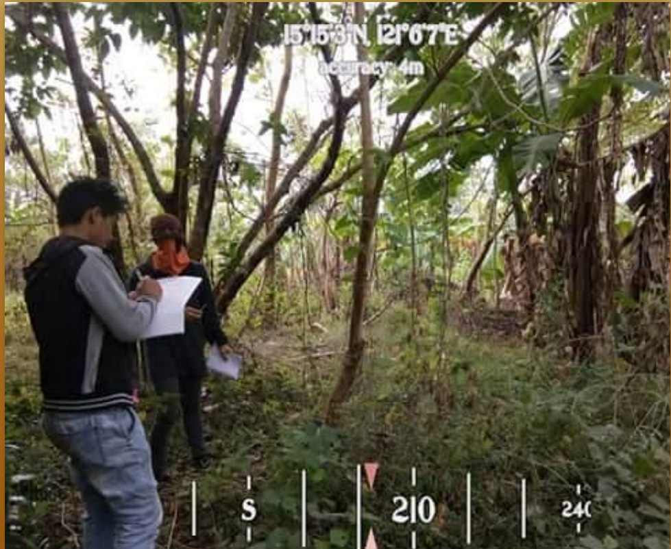
Validation of NGP sites.