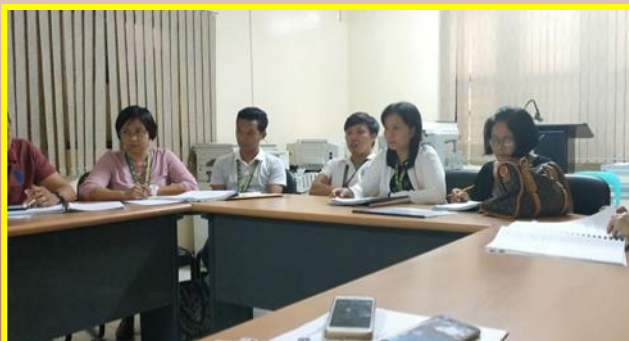
Some of the proponents of RET projects while defending their proposals in the RET Council meeting on Aug. 9, 2019.

The RET Council meeting was held on Aug. 9, 2019 at the Administration Building Conference Room. A total of four research proposals and one training proposal were approved during the meeting. The new policies and amendments/revisions to the RET manual were also discussed.