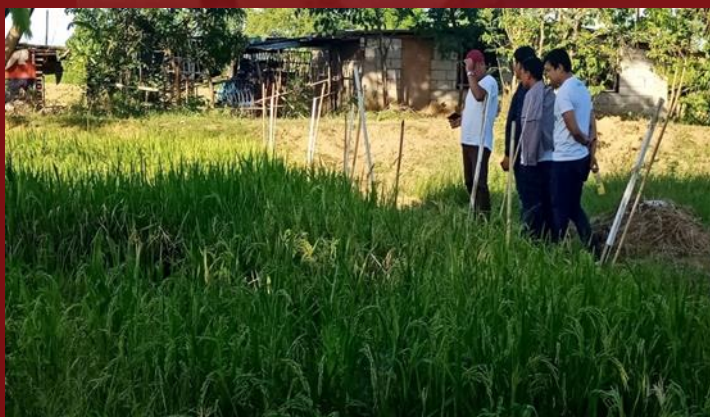
Onsite visitation and monitoring by PhilRice at Calasag, San Ildefonso, Bulacan on April 29, 2019.