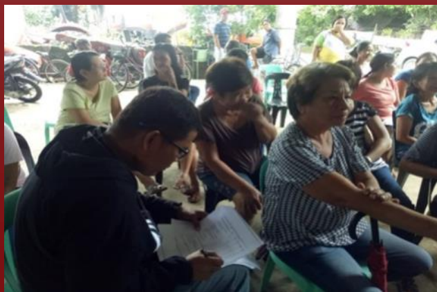
The project staff while conducting interview to the members of Maronquillo Multi-Purpose Cooperative in San Rafael, Bulacan on August 10, 2019.