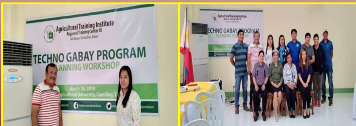
Group picture of participants of Techno Gabay with invited guests.