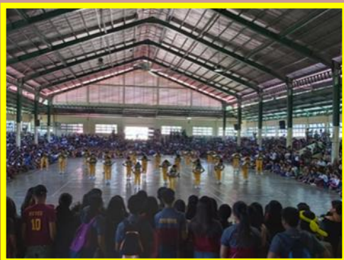
Cheer dance competition in action