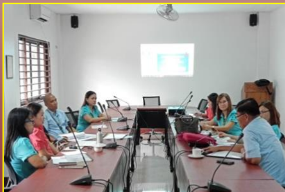
February 13, 2019: The members of the PDG conceptualizing the initial Integrated BASC RDE Plan.

The RET-Project Development Group (PDG) was held its first meeting and date of establishment last February 13 at the FTC. The meeting was presided by the VP-RET and her two Directors. Communication letter pertaining to the creation and functions of the newly formed group was then approved by the College President. The main aim of the RET-PDG was to conceptualize the BASC Integrated RDE Plan. A follow-up meeting was held last February 19 to finalize the draft framework that was made during the first meeting.