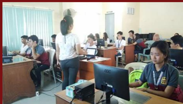
BSIT students utilizing the system in their laboratory class.