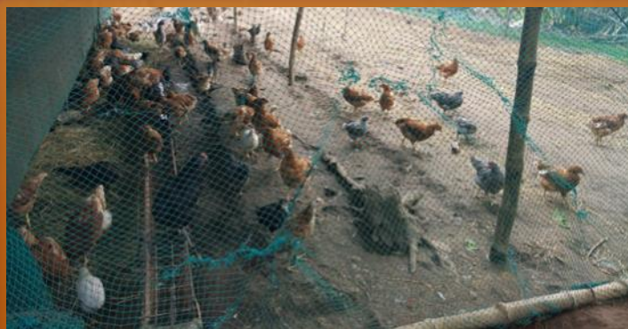
Free range chicks and pullets that are being readied for dispersal were housed temporarily in an enclosure within a newly-harvested rice field.