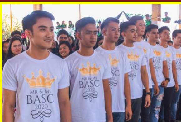
The first public appearance of the Mr. and Ms. BASC 2020 Candidates