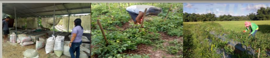
Women participants, harvesting vegetables from the project area located in San Ildefonso, Bulacan last February, 2019