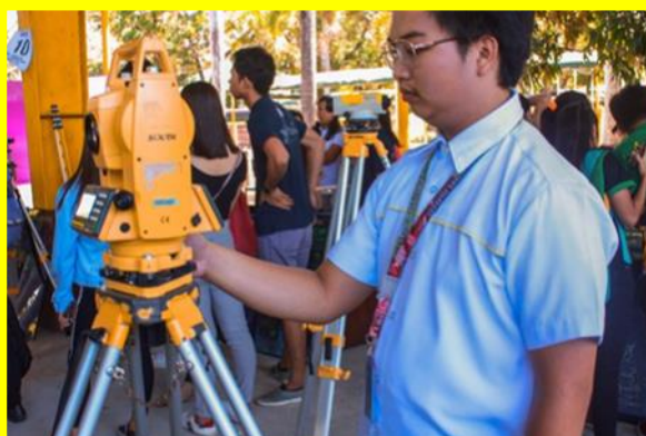
The Students showcasing the different Products and Practices of their respective Institutes