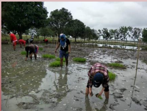
Lay-outing and transplanting of seedlings in NCT-HR project on Feb. 13, 2019.