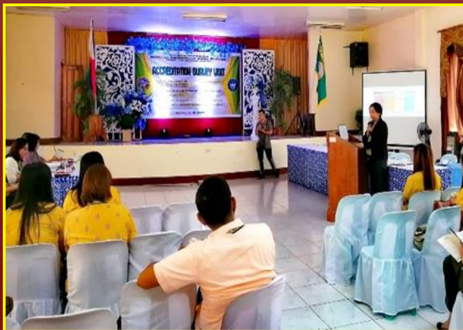
AACCUP Accreditation Survey Visit: BSAM Level III Phase 2 Presentation and Defense of Narrative Profile and Compliance Report