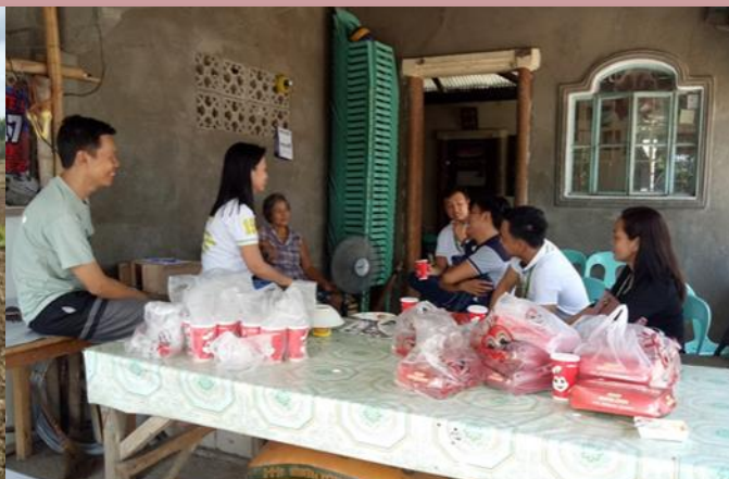
Initial plowing of land at the GSR Site in Brgy. Umpucan, San Ildefonso, Bulacan ( left ). Initial planning of the second phase of the GSR Project with the cooperator and the GSR Project staff ( right ).