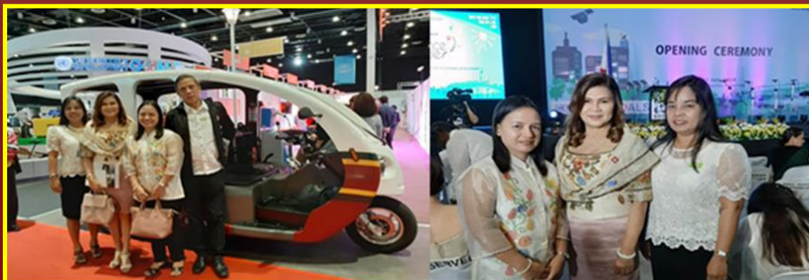
RET Management Team and the BASC President during the opening ceremony for the National Science and Technology Week on July 17, 2019 at PICC.

The RET management team (VP-RET, Research Director, and Extension Director), together with BASC President, attended the opening ceremony of the National Science and Technology Week (NSTW) on July 17, 2019 at the Philippine International Convention Center (PICC), Pasay City. The opening ceremony highlighted the presentation of DOST's accomplishments in bringing S&T closer to the Filipino people, and the awarding of outstanding scientists in various categories. Dr. Leonor Briones, DepEd Secretary, represented the President of the Republic, Pres. Rodrigo Duterte as the keynote speaker in the program.