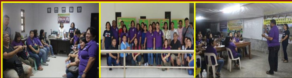
The 25 LRDD staff courtesy call at FTC Bldg. and orientation at BASC Windmill.

The Bureau of Animal Industry- Livestock Research Division conducted a field techno-demo at BASC last April 5, 2019. The LRDD staff visited the BASC Windmill Collaborative demo farm at Malipampang, San Ildefonso, Bulacan.