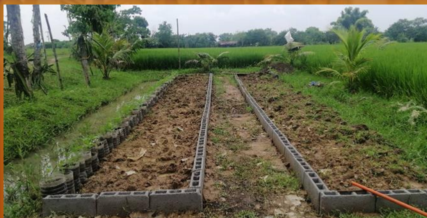
New area being developed as forage garden for the free-range chicken project.