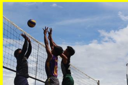
Sports Activities Intramurals 2019