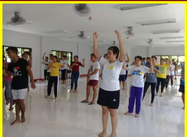
Summer Folk Dance Training Workshop for students July 9-12, 2019