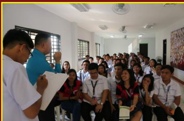
The Accreditor interviews the student representatives from the different institutes.