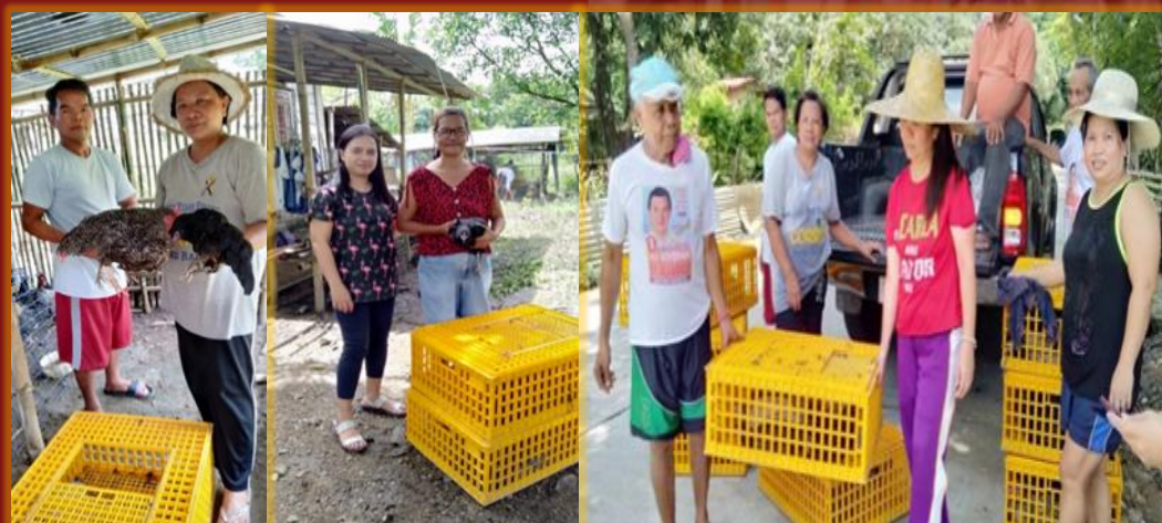
The project members dispersed 150 heads of free-range chicken to 5 recipients in Brgy. Maasim & Umpucan, San Ildefonso, Bulacan.