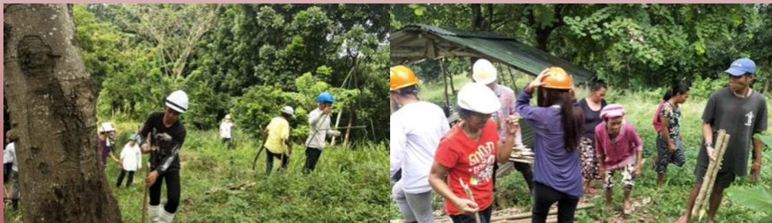
The farmer-participants constructing their A-frame for the hill-land farming during the training at Sapang Bulac, Doña Trinidad Bulacan last August 5.