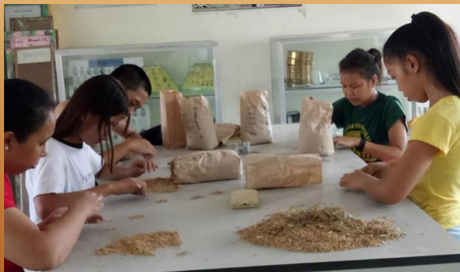
BSA students helped in the processing of collected samples.