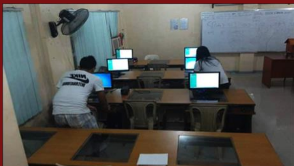
Photo taken during the preparation of the laboratory room to be used in the study.