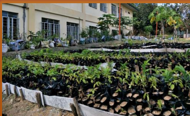
Sugar apple production at BASC New Site.