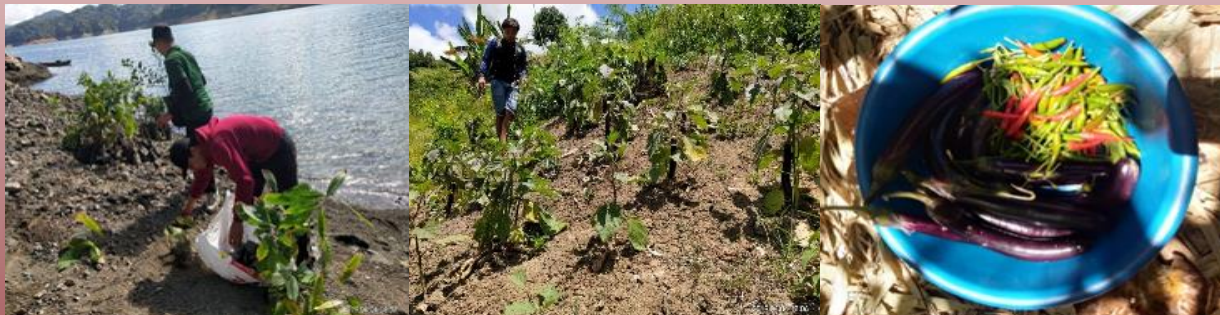
(Left picture) The team unloaded the fruit bearing trees from the boat. ( middle and right side picture) Project site and harvested the produce of eggplant and hot pepper.