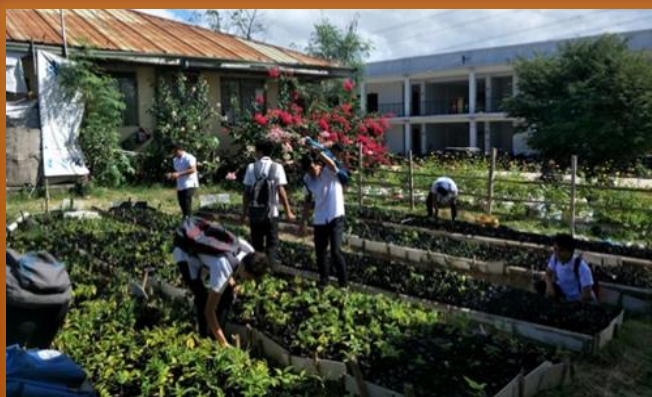
The students from the Institute of Agriculture helping in the production of seedlings.