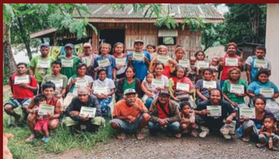
Training on Crop Production Technology last August 2, 2019 at Dumagat Livelihood Center, Sitio Mag Asawang Baton, San Lorenzo, Norzagaray, Bulacan