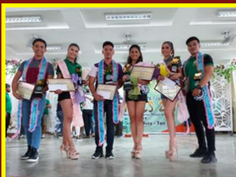
Winners of the Mr. and Miss Intramurals 2019