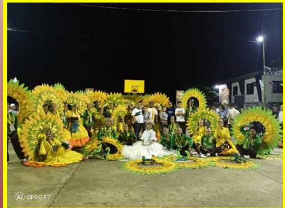
Champion in street dancing

BASC Liping Tagalog Folkloric Group rendered an intermission number (June 25, 2019) at the College Gymnasium