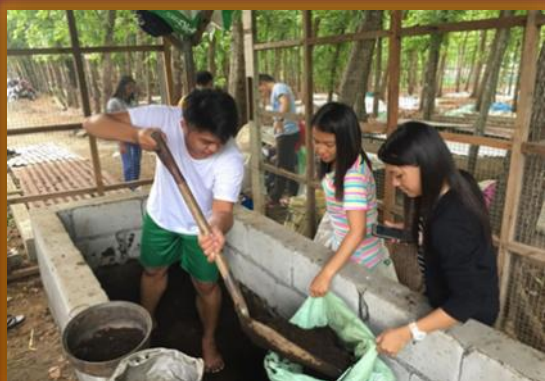
BSA students helping in the cultivation of vermibeds.