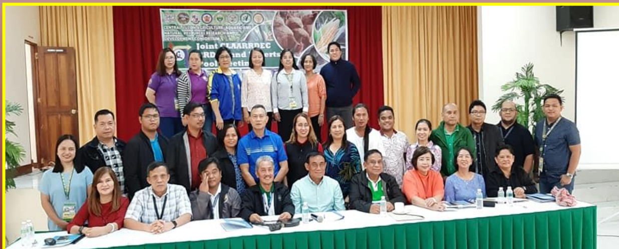
The officials and pool of experts of CLAARRDEC and its member institutions after their 2nd Quarter 2019 meeting on July 2, 2019 at Bulacan Agricultural State College.