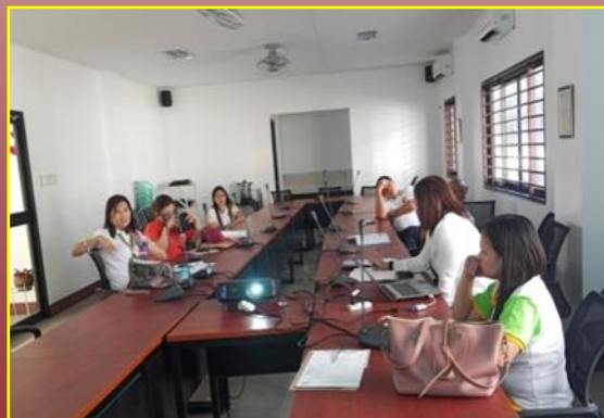
February 19, 2019: The members of the PDG finalizing the Integrated BASC RDE Plan.