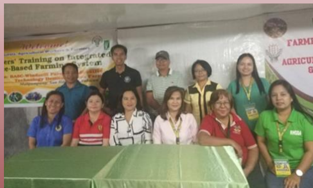
Project team of the rice-free-range chicken project together with the management of BASC RET, MAOs, PAO representative, and DA_RFO III representative after the MOA signing as part of the project launching.