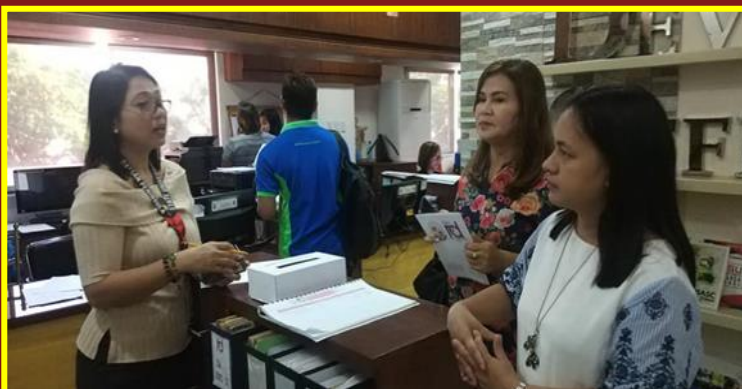
The Training and Events Coordinator of BPSU-RET