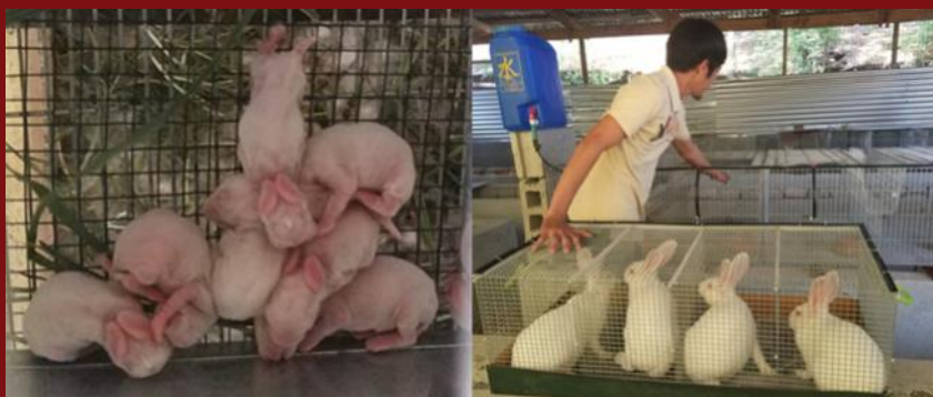
Left: The seven kits from doe #1 at day 14 (Feb. 1). Right: four of the 6 new breeders that were delivered on Feb. 22, 2019.