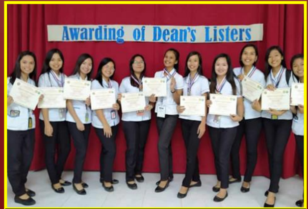
The Dean's Lister awardees being recognized by their outstanding efforts and dedication during the Awarding Ceremony of the IEAS Dean's Lister held at the Rene Cayetano Hall.