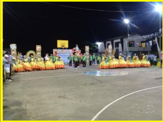
Best symbolic performance in Dance Showdown

BASC LTFG Participated in the “Indakan sa Kalye para kay Maria”, a street dancing competition and dance showdown at Caingin, San Rafael, Bulacan. (May 9, 2019)