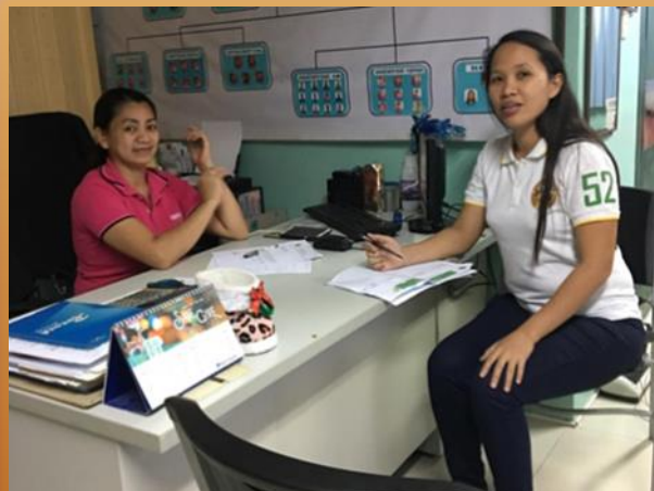
Data gathering at Palayan sa Nayon Multipurpose Cooperative last April 15, 2019.