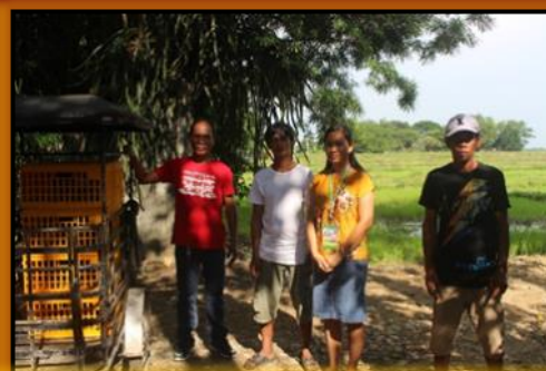
Right picture: Free-range chicken dispersal of farmers