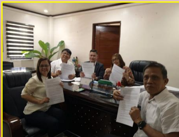
Signing of Memorandum of Agreement with SDO Bulacan for the offering of Agriculture Courses at F.F. Halili National Agricultural High School in Sta. Maria, Bulacan