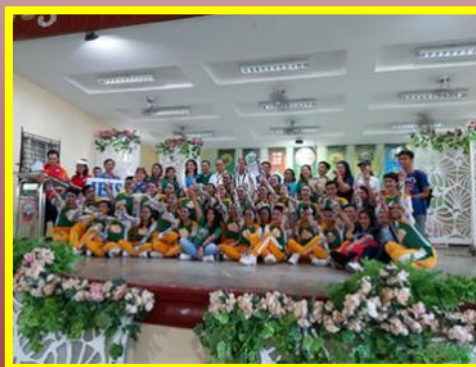
Cheer dance champion (IEAS)