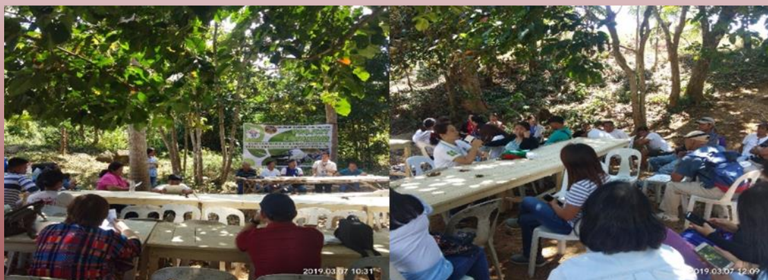
Project launching at Barangay Sawmill, Gabaldon, Nueva Ecija last March 7, 2019.